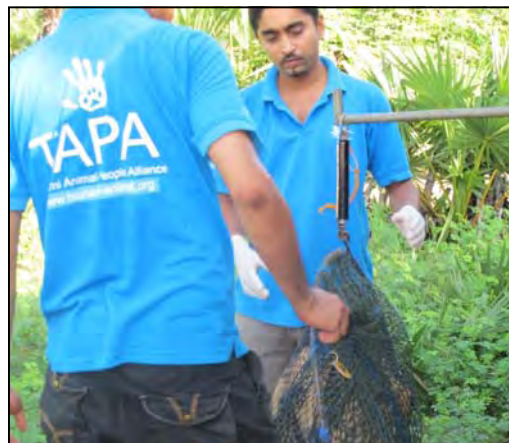
Safely carrying a dog in the net back to the Field Clinic and then weighing