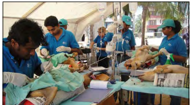
Spay/neuter surgery under way in a tourist area

Programmes were then subsequently organised in the tourist areas of Tangalle and Hambantota on the Sri Lankan South Coast. In addition to helping the animals, the positive response of tourists will help encourage further growth of the tourism industry, which contributes to the local economy.