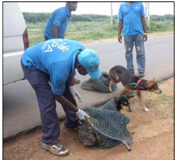
Releasing dogs to the exact place where caught after recovery

The TAPA field clinic continues to successfully demonstrate that the standards expected in a static veterinary clinic can also be attained in a field environment. To verify this success, the TAPA team implemented a follow-up research programme, which monitored and collected data on 100 dogs daily post-surgery (20%-25% of a typical month's field work). The very positive results demonstrated that about 96% of all dogs have an excellent recovery post-CNVR. The remaining 4% also had an acceptable recovery with only minor self-correcting complications. Protocols for special case dogs are further improving this percentage.