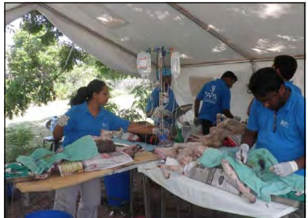
Spay/Neuter in the TAPA Field Clinic

Our strategy is to implement a no-charge Catch-Neuter-Vaccinate-Release (CNVR) programme in the tsunami-impacted zone and former war zone. TAPA's mobile tent-based surgical field clinic moves from community to community with a goal of sterilising and vaccinating at least 75% of the dogs (community/street dogs as well as individually owned dogs). We adhere to high standards of asepsis and use specialised surgery protocols, including pain management, which is humane and conducive to fast healing. The dogs are returned to the exact spot where caught (or to their owners), to make use of their territorial nature to manage the population. This is a critical factor to success as they will keep unsterilised and unvaccinated dogs away. We use large "butterfly" nets to humanely catch community/street dogs, which also reduces the risk of injury to them, as well as to TAPA staff.