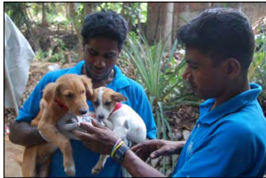
Our team members are very committed to animal welfare - it's not just a job to them

TAPA introduced Early Age Neutering (EAN) to Sri Lanka as a safe and effective population management method. We screen for eligibility for EAN by age, weight, general condition, and any specific medical conditions. TAPA has also raised awareness of post-surgery pain management and mitigation techniques. We do not spay lactating females.