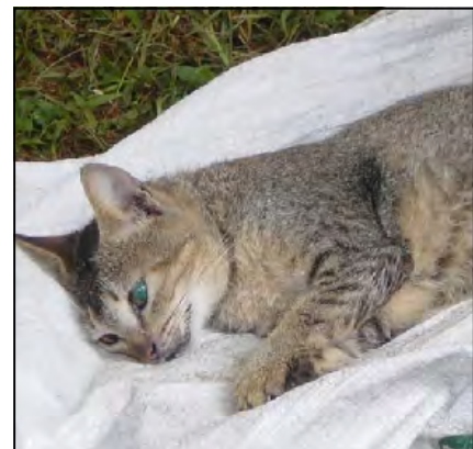
Sterilised cat recovering in the Field Clinic