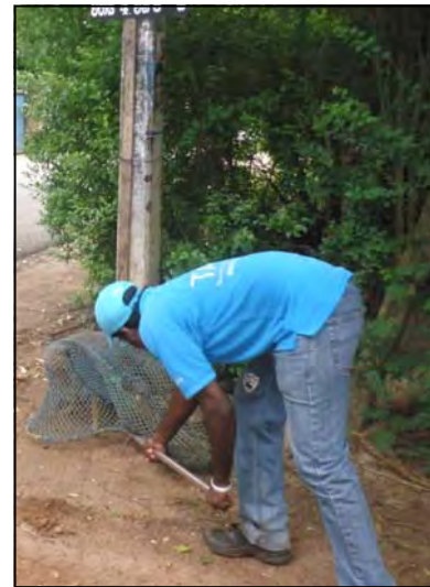
Catching a dog using a net—safer for the dog and for the team than using catchpoles