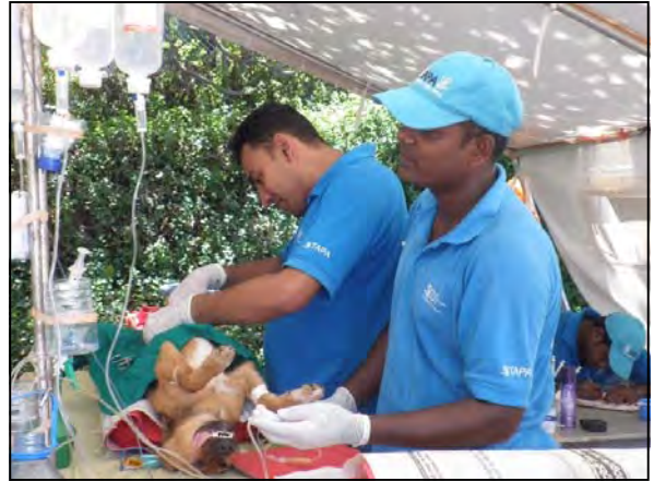
Sterilisation Surgery in the TAPA Clinic

TAPA 's appointed auditor (Sri Lankan Chartered Accountants A&S Associates of Colombo) provides continuing guidance to ensure that our accounting methods conform to professional norms. The Sri Lankan Fiscal Year is April 1 – March 31. A&S audited the books for the Fiscal Year ending 31 March 2011 and will do so again for the Fiscal year ending 31 March 2012. TAPA also retains a part-time accountant/administrator for several hours per month. Financials are available upon request.