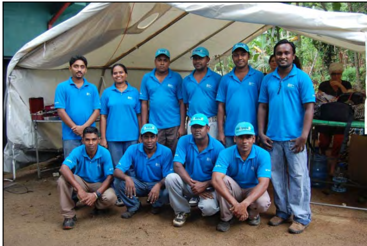
TAPA Field Team

The TAPA Field Team includes veterinary surgeons, vet nurses, animal handlers, community liaison, van driver, and education programme presenters. The team achieves its effectiveness and efficiency through flexible cross-over responsibilities – for example, the vet nurses and vets assist in catching dogs when needed, and several of the vet nurses and animal handlers are cross-trained.