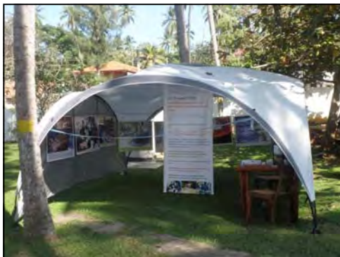
Exhibition tent in Tangalle