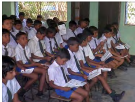
Education programme in the former war