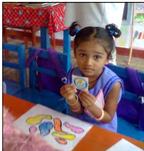
"Vaccinate & Sterilise" labels donated by Studio Labels (Australia)