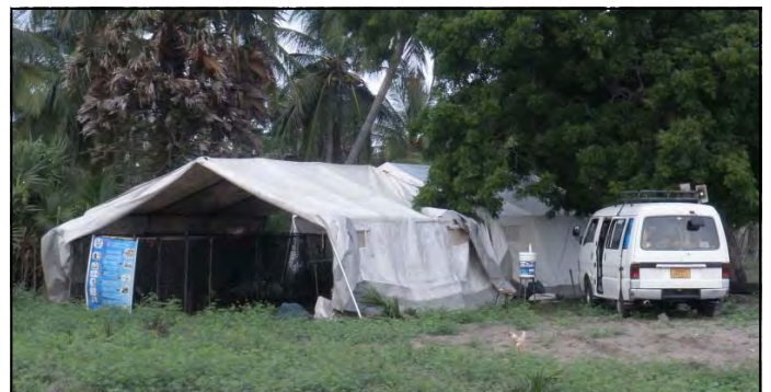
TAPA Field Clinic tents: when feasible, we also set up in abandoned buildings, government building porches, etc., to reduce setup-takedown times.