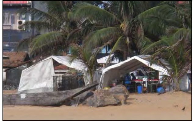
TAPA Clinic set up on the beach in Negombo