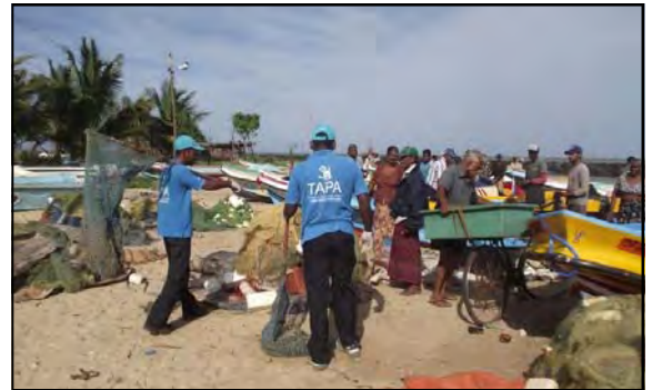
Netting in the fish market area on the beach

After seeing what TAPA could do, we were invited by the Tourist Board to participate in the U.N. World Tourist Day in September with a week of accompanying activities. TAPA set up in the carpark of the world famous Mt. Lavinia Hotel. In addition to CNVR, there were visits by religious leaders, various officials (including the American Ambassador to Sri Lanka), visits by students, an exhibition area, an education programme and a visit by Ms. Otara Gunawardena, Sri Lankan Ambassador to World Animal Day.