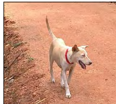
Dog back in home territory after recovery and release