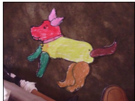
"Poseable Dog" Crafts Activity—adapted from Helen Woodward Animal Center (USA). The children assemble and colour a dog from paper, and then the finished product is used to demonstrate dog behaviors to help the children safely interact with dogs and avoid dog bites.

The presentations cover rabies facts, including facts and myths about rabies, precautions, prevention, and treatments; how to avoid dog bites; responsible pet ownership; and how Catch-Neuter-Vaccinate-Release impacts the dog population. For the younger children, we focus more on raising awareness that animals are to be respected as sentient beings sharing the earth with us. We use toy animals, stickers, singing, dramas and paintings to transfer this message to the young children.