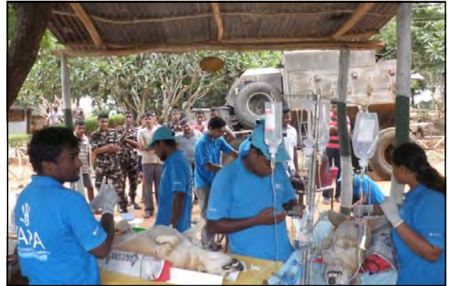
Spay/neuter surgeries in the former war zone

The military provided logistics support and opened doors with local officials. In addition to providing our team the opportunity to help rebuild their country, we found it very positive that enlightened military leaders were discovering that spay/neuter is the solution to managing the dog population.