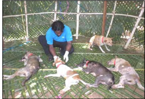
Dogs recovering from sterilisation

During 2011 the team sterilised and vaccinated 4,345 animals. This was slightly below the target of 5,000 because the team spent January through March doing flood disaster relief for animals (no spay/neuter) and due to several spells of heavy rain during the rest of the year (rain makes it difficult to both catch dogs as well as operate the tented field clinic). We also lost some time due to damage to our large hospital tent caused by sudden and severe storms.