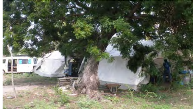
TAPA's field clinic sets up right in the tsunami zone or the former zone—wherever we need to go—often right next to the rubble of buildings

Funding remains our most serious challenge. It is not inexpensive to field a team of ten working for extended periods in remote locations. Our cost to sterilise a dog or cat is approximately US$20 (about US$8 for good quality medicines and surgical supplies plus about US$12 for staff salaries, housing and food, van to transport dogs and equipment, etc.)